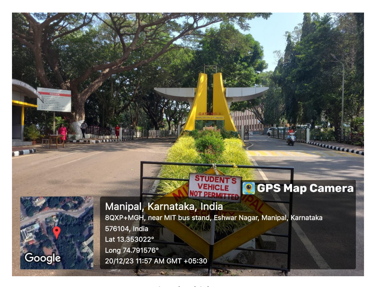
Restricted vehicle entry