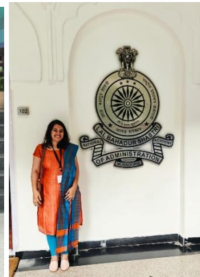
First in-person Residency Leadership Training at Mussoorie from July 22 to July 26, 2024