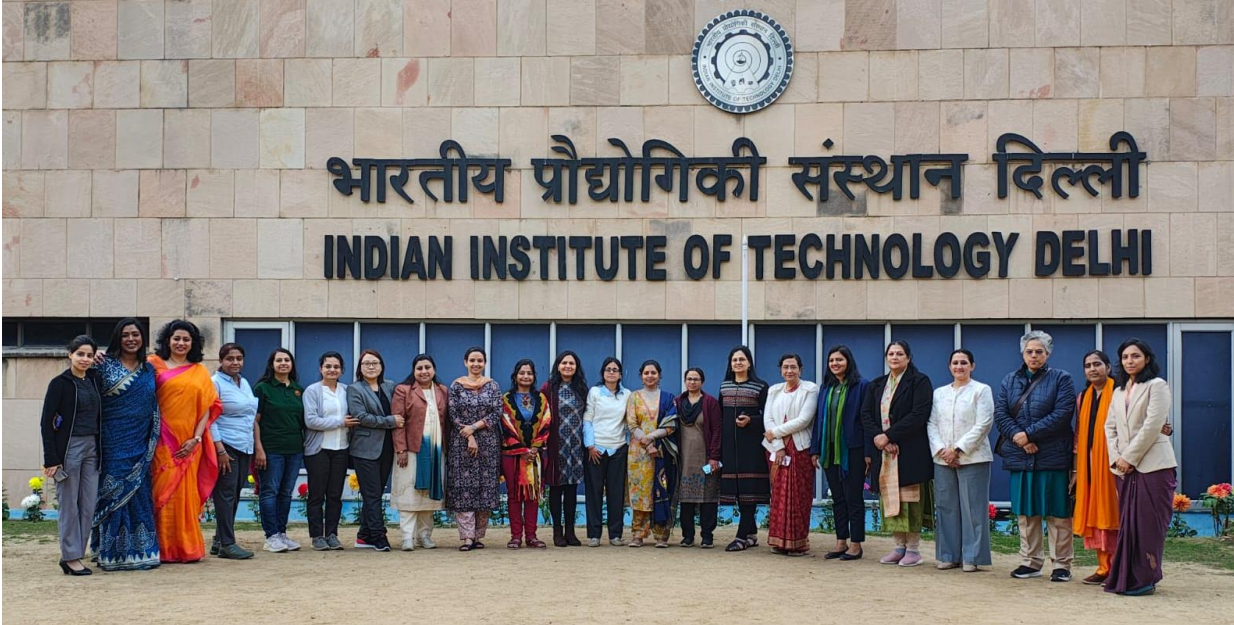
Third in-person Residency Leadership Training at Bengaluru from January 28 to January 31, 2025, New Delhi

Profile of the Experts in the Programme: Not Applicable