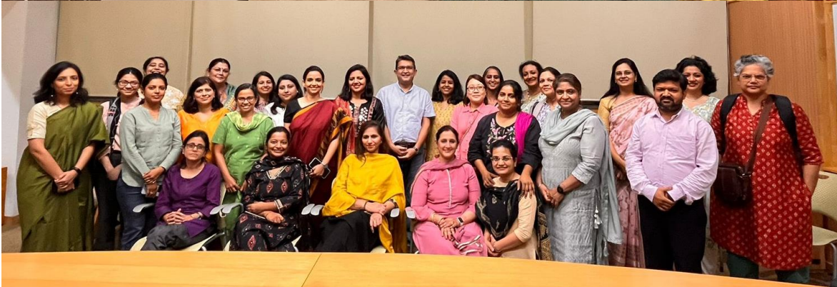
Second in-person Residency Leadership Training at Bengaluru from October 22 to October 25, 2024.