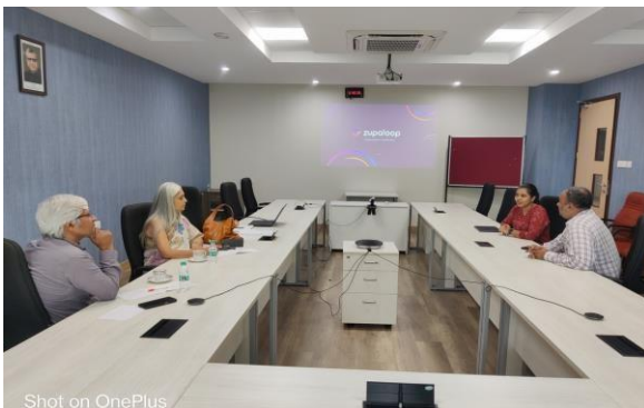
Shot on OnePlus