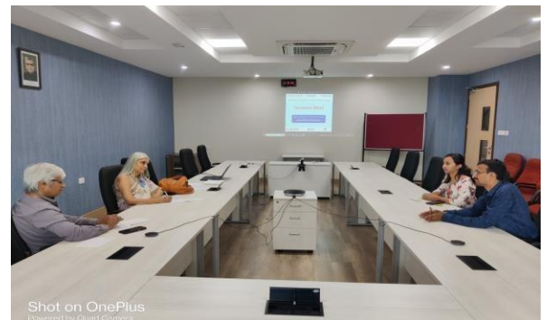
Shot on OnePlus Powered by Cloud Camera